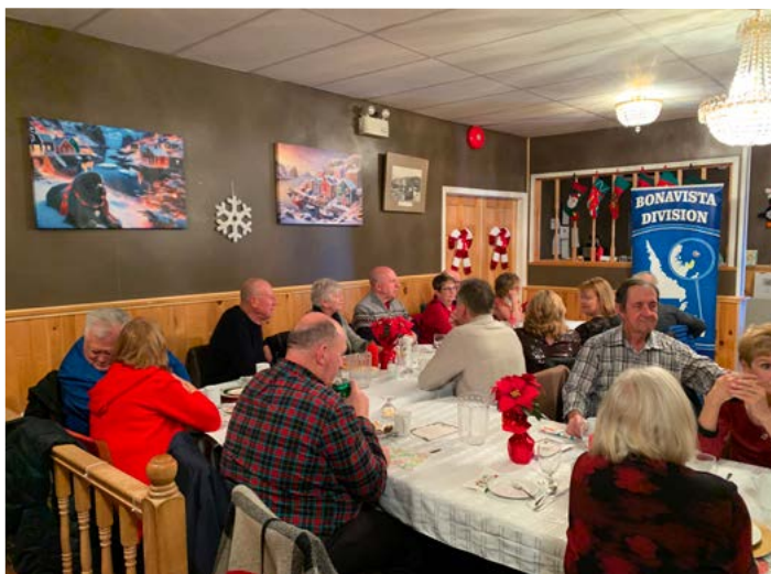
The Bonavista Division Christmas Social.

We held three executive meetings since Christmas, one on February 16, one on March 23, and the other on April 17. The first meeting was held at Bonavista Memorial Library and the other two were held at the homes of two of our Executive members. At these meetings we planned a general meeting for May, our spring social to be held in June, and we brainstormed for some new ideas for future events. We also made a start on creating our Executive Handbook.