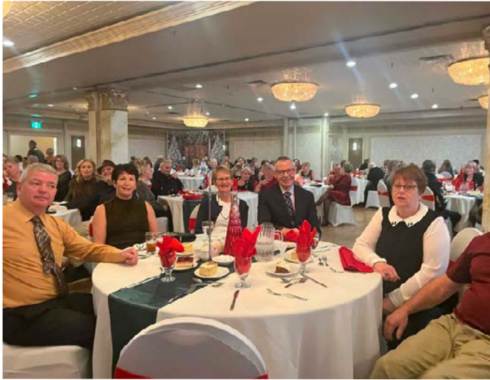
Burin Division members enjoying the Christmas social.

In November, we participated in laying our wreath at the Burin Remembrance Day ceremony which had to be held inside due to the very inclement weather. There were several retirees present, and it is always nice to participate and pay respect to our veterans for their great sacrifices. Also in November, we held our “Coffee Break” at The Merge in Marystown. Once again, this provided an opportunity for retirees to drop by, enjoy a chat, and reconnect with fellow retirees. Thank you to The Merge for providing such a nice venue to host this event and to our faithful retirees for organizing it.