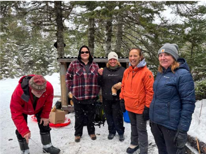
Tri-Bay Division members enjoying the great outdoors!

This year was perfect for some outdoor adventuring, so on a snowy morning in February, we went snowshoeing in Bloomfield and had a fire and boil up. This was a beautiful day enjoying the great outdoors.