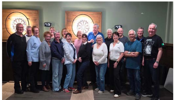
Dart League Participants.

Our Executive met on March 20 to plan our upcoming events for the rest of the year. One event planned was a dart shoot/social at Chalky’s Bar in Marystown for mid-April. In early June we will be holding our AGM and election of officers. At this time will be putting plans together for representatives to attend the BGM in St. John’s on October 6-8.