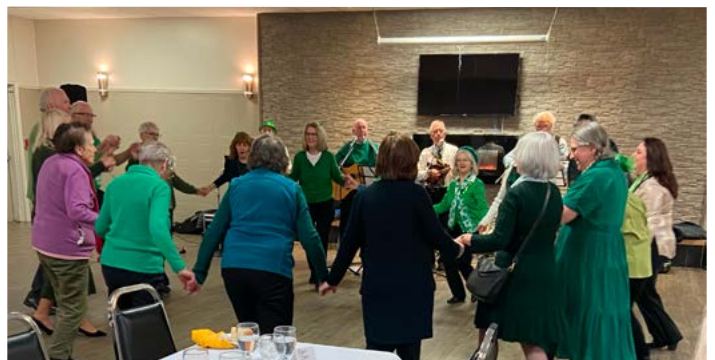
Avalon East Division members hit the dance floor and danced the afternoon away!