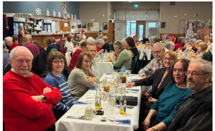
Retiree's enjoying a Christmas luncheon.

But we survived the prolonged snowy season with the help of a few RTANL social events. In December, our Christmas luncheon at the Santa Maria club was a successful gathering. Over 80 people were in attendance for a delicious turkey dinner. After our meal, two of our members led us in a Christmas singalong. At that event, we continued a practice started the previous year and collected funds for the Retired Teachers' Foundation. As in 2024, we also set up a table where attendees could write messages to retired teachers in seniors' homes and long-term care who would receive Christmas visits from the Executive.