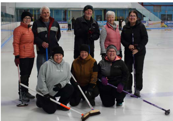
The Bonavista Curling League's Funspiel.

A dozen or so of our members continued to curl on Thursday mornings, and on the weekend of March 13 we iced two teams in the Bonavista Curling League's Funspiel. We look forward to this event every year and enjoy the fun and relaxed, albeit a bit more competitive, atmosphere. It was a great weekend, both teams curled well and one team made it to the finals!