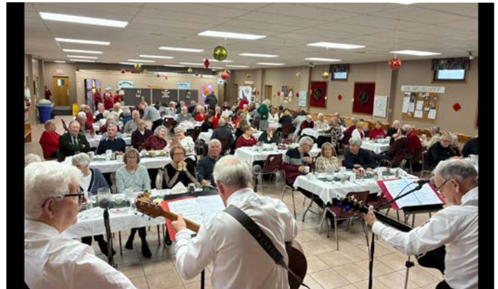
Members of Western Division at the Christmas Social..

The West Coast is having a “good winter” in Spring! As I look out my patio door, the snow brings me back to the preparations for our Christmas Social which was held on December 8 at St. Michael’s Church Hall. During my terms as President, this was by far our most successful event! The venue could hold 100 guests and all tickets were sold. Western Division subsidized this event for our retirees, and many great compliments were received via email, word of mouth, etc. Poinsettias, bottles of wine and gas cards were some of the prizes drawn for throughout the event. What made many retirees smile even more was seeing every place setting decorated with a small reusable mason jar, filled with Christmas treats for them to take home. We are already making plans for next Christmas! Now... back to my report!