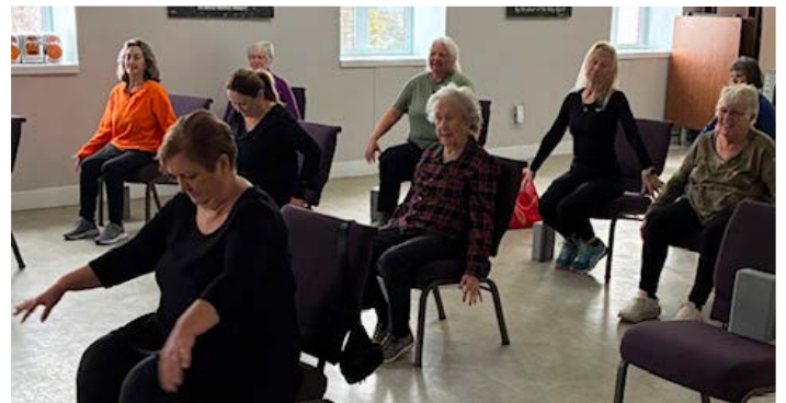
Stephenville Regional members enjoying Chair yoga.

February found us fighting off the winter blues by organizing an exercise class as we had done for the previous two winters. This year, our activity of choice was chair yoga. About 20 of us attended a session in which our instructor led us through a series of gentle movements beneficial to our joints and muscles.