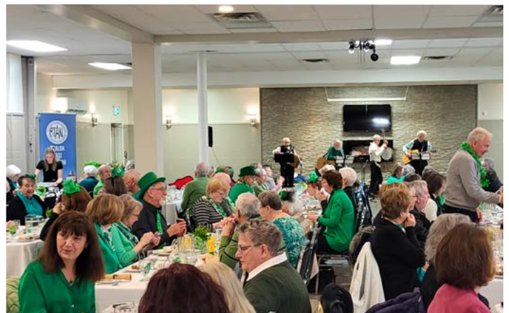
Attendees enjoying their meals at the Scoff and Scuff.