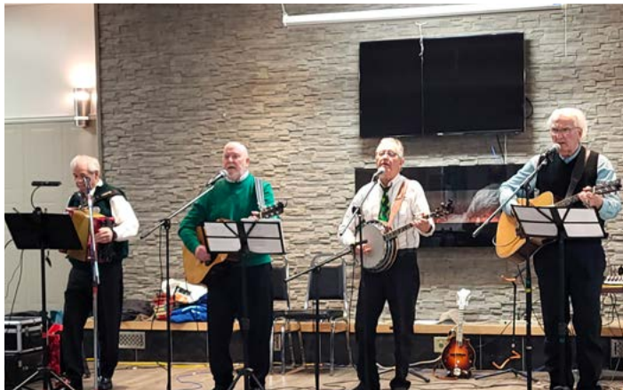
Kilmainham kept the crowd entertained at the Avalon East Division's Scoff and Scuff!

The executive met in January to plan the remainder of our year. There were two events to organize: our Spring Scoff and Scuff on March 10 and our AGM on June 8.