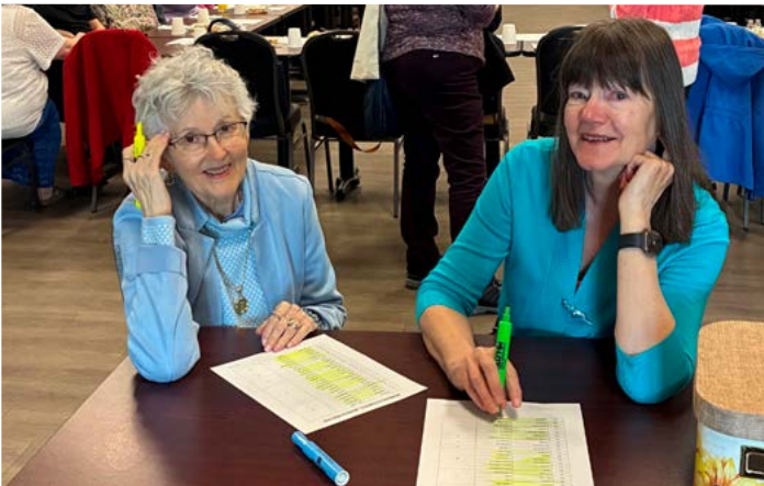
Stephenville Regional Lunch and Election.

At this meeting as well, we voted on a name to reflect our new geography and decided on Southwestern.