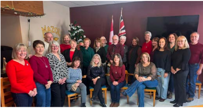
Christmas dinner at the Shriners building in Clarenville.