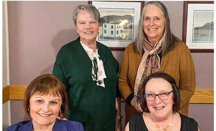
Plaisance Regional Executive.

A lunch was held at Harold Hotel on May 25, 2023. This was the first time our group held a function since the pandemic so the smiling faces say it all. Another event is planned for the fall. We are about 70 strong in the Placentia area.