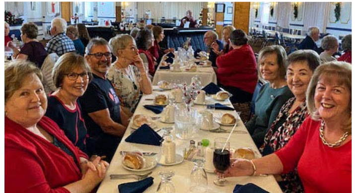
Members of Stephenville Regional attend Christmas social.

It was at the Legion as well that we held an earlier event; it was the venue for our Christmas 2022 social. For this occasion, on December 9, we had about 60 people in attendance. Those who wore red or green had their names submitted for a prize draw. There was also a door prize as well as a few smaller prizes. The turkey dinner was delicious and enjoyed by all who attended.