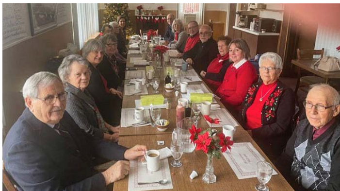
Con-Tri members enjoy a spring luncheon.

executive meeting on April 6, 2023. It was there that we decided to schedule a guided tour and luncheon to the Winterton Boat Building Museum for June 13. In recent conversations and email communications with our members we expect to have a good turn-out to that event. We are further planning a fall outing to the Baccalieu Museum in Lower Island Cove.