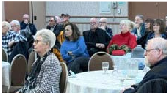
Attendees at Central Division spring meeting and luncheon.

Central Division's Executive met on April 5 to plan activities for this year. It was our first meeting since November 2022, although there had been numerous emails and calls. One suggestion was to have an information session and luncheon in Gander in May or June. We planned to present information on our present pension plan and have answers for questions from our members. In October 2022 an information session and luncheon at Grand Falls-Windsor attracted 60 members. That was a much larger attendance than usual, thus a follow up format was suggested.