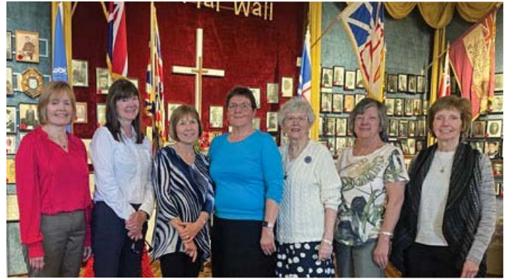
Stephenville Regional Executive members.

also to reconnect with old friends and former colleagues. The Stephenville Legion provided a beautiful setting for this gathering.