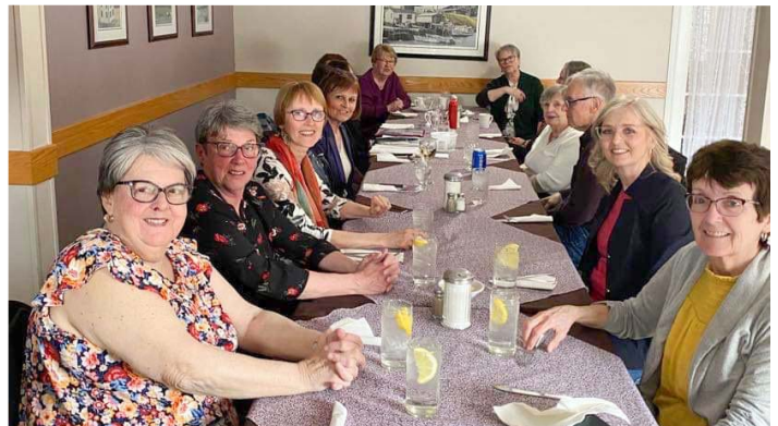
Plaisance Regional attendees at luncheon on May 25, 2023.