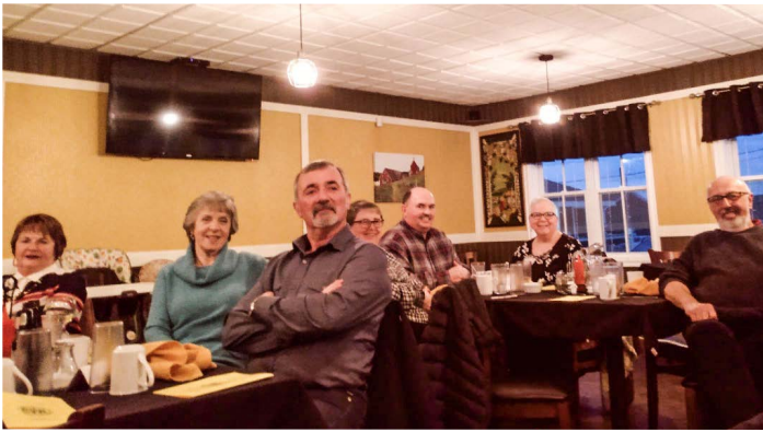
Bonavista Division Christmas social at the Fireside Dining Room.

A dozen or so of our members continued to curl together on Thursday mornings. On the weekend of March 10, we iced three teams in the Funspiel that was sponsored by the Curling League. A great time was had by all our participants – one team even made it to the playoffs.