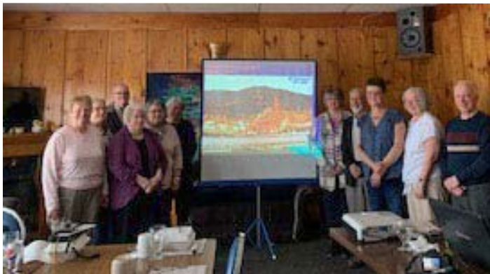
Members of Coast of Bays Division at their Spring luncheon.