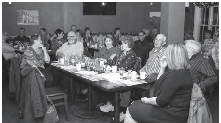
Members of Bonavista Division at the Christmas Social.