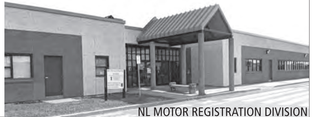
NL MOTOR REGISTRATION DIVISION

If you have email , you may also sign up to receive a renewal reminder re your Driver's License by email. It is your personal responsibility to maintain a valid Vehicle Registration and a valid Driver's License . There is a $250.00 fine if either is expired!