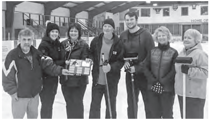
Winners of the Dave Smith Curling Funspiel.

Maybe next year, one of our teams can bring home the championship trophy.