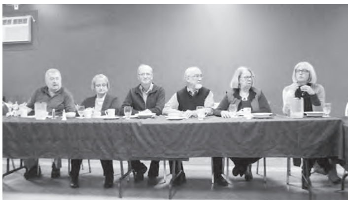
RTANL Provincial Executive members enjoy lunch with members of the Executive of the Coast of Bays Division.