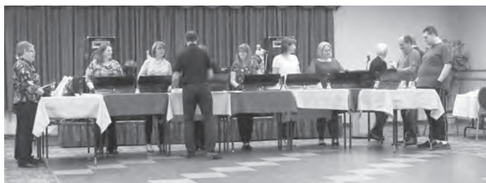
United Church Handbell Group