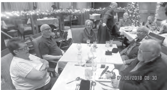
Dinner at Sinbad's