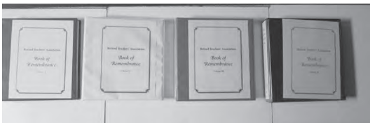
Remembrance Books To Date