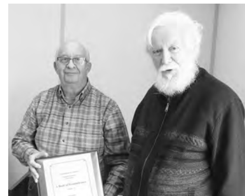
Presentation of Remembrance Book 4th edition.