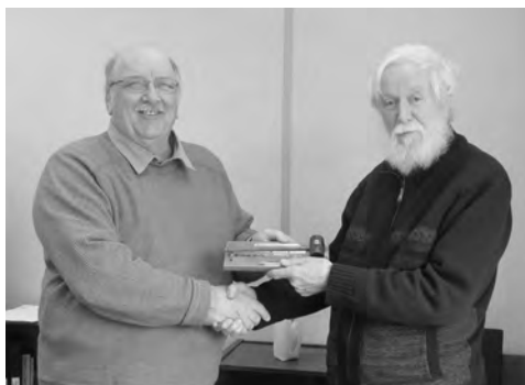
Passing of the Gavel