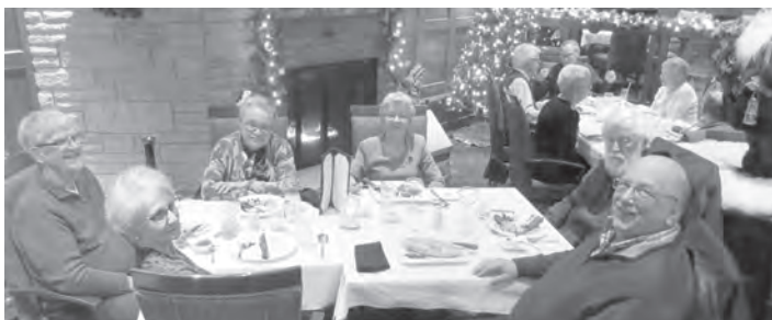
Dinner at Sinbad's