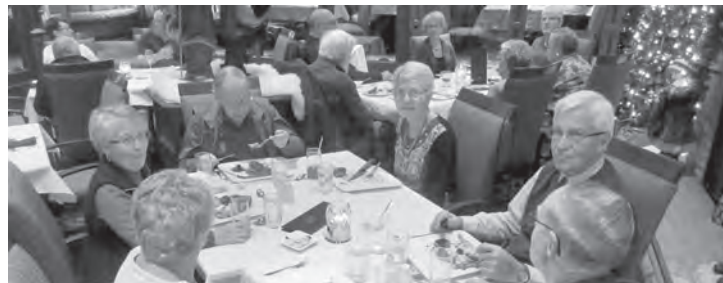
Dinner at Sinbad's