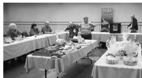
How Much am I Offered?