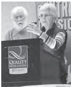
Let the Meeting Begin