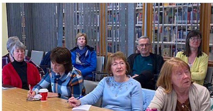
Members of Stephenville Regional attending the Wills and Power of Attorney Presentation.

Greetings from Stephenville, where we enjoyed a beautiful summer and fall!