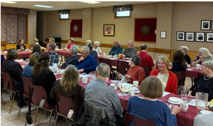
Members of Western Division at the October Luncheon.