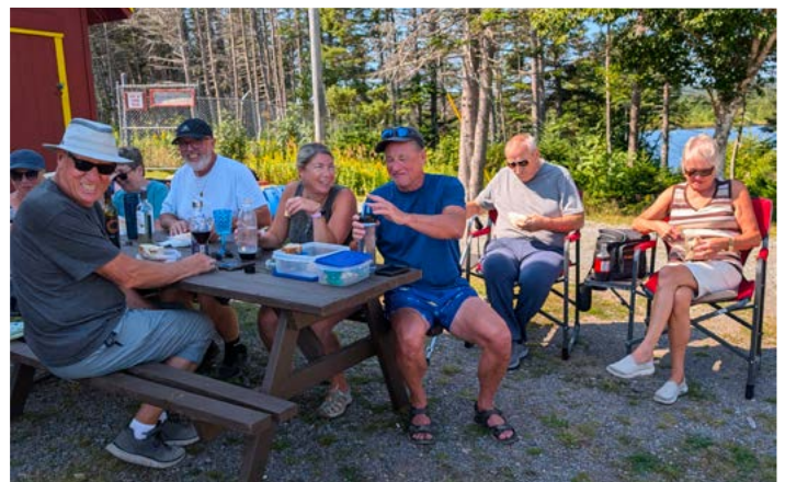
Bonavista Division not-back-to-school picnic in the park.

Our new year began on September 4, with a not-back-to-school picnic in the park. Lookout Park in Trinity Bay North was the setting for this event; we played lawn games, had a picnic lunch, and walked the trail around the pond. The weather cooperated with sunny skies and warm temperatures; it certainly was a great day not to be back to school!