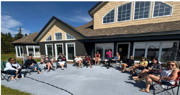
Members of Tri-Bay Division at their Not Back to School BBQ.