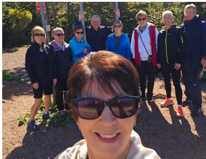
Burin Division members hike The Cape Trail.