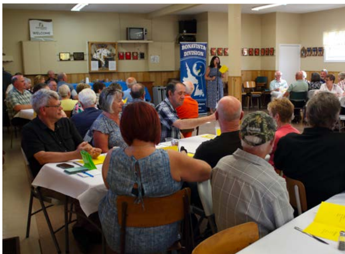
The Bonavista Division Spring Banquet.

The members of Bonavista Division continue to celebrate retirement with a mix of informational meetings, recreational activities, and meals. Since our June report we have had a bit of all three.