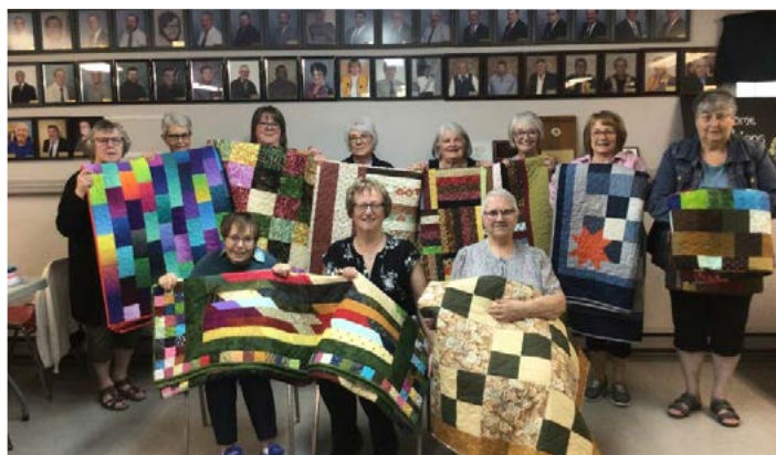
The Material Girls and the eight quilts they donated to the Lion Max Simm's Memorial Camp.

Greetings everyone from Burin Division. Once again, I have to say how time just flies faster each year.