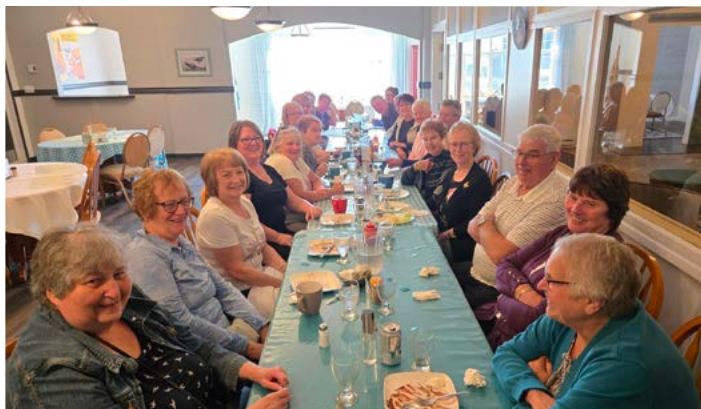
Burin Division luncheon at Rita's Kitchen in St. Lawrence.

As usual, we planned our first luncheon to be held on September 25 at Rita's Kitchen in St. Lawrence. Before the luncheon, we planned a hike to The Cape Trail. We had 14 retirees take part in the hike before heading to Rita's Kitchen to meet with the rest of our members for lunch. We had 22 in attendance for lunch, which consisted of a choice of hot turkey sandwich, clubhouse and fries, pan-fried cod with choice of potato, and munchies for one. To top the meal off, most had a choice of bakeapple cheesecake, blueberry cheesecake, and a variety of chocolate desserts. All meals were delicious and hats off to the cooks.