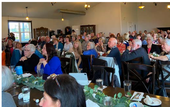
RTANL Avalon East Division Octoberfest held at Lester's Chalet had a Full-House.

The new Executive met in August to begin our year. We planned the Octoberfest on October 16 and our Christmas Luncheon on December 1. Our Octoberfest was a success, with 120 attendees.