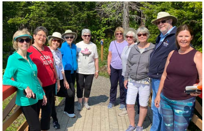
Members of Stephenville Regional hike around Ned's Pond.

In May as well, our Executive was invited to St. Thomas Aquinas School breakfast program to present a cheque from the Western Division. Students from various grade levels were on hand to accept this presentation and were happy to chat about how much they enjoyed what the breakfast program had to offer. We would like to thank the Western Division for this opportunity.