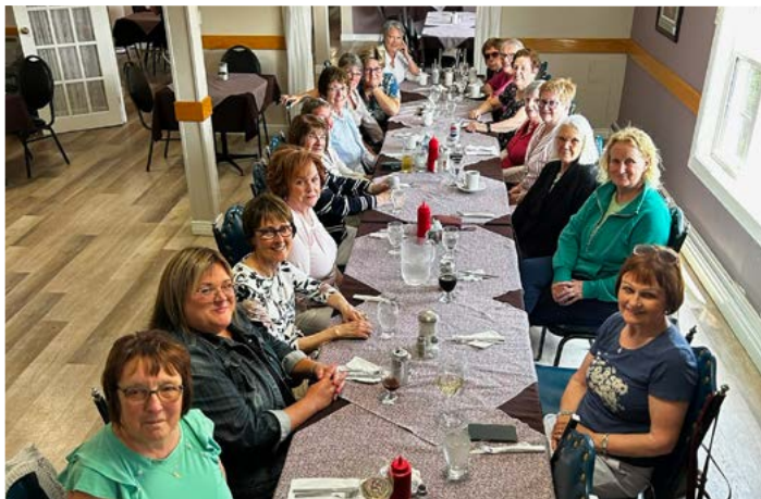
Plaisance Regional Members enjoying lunch at Harold Hotel.

On a very positive note, we had several recent retirees as well as our oldest member who is 91 years young. As well, there were two other attendees over the age of 80! Everyone appreciated the opportunity to get together in our busy lives.