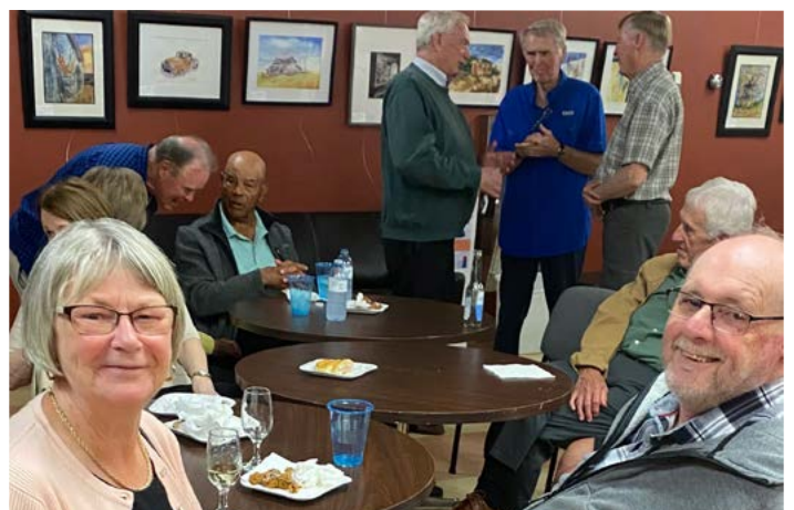
Good-bye Summer event hosted by Stephenville Regional.

To celebrate the beginning of summer, we did a walk around Ned's Pond in June. Mother Nature co-operated and sent us beautiful weather. We were small in number but large in enthusiasm as we chatted and enjoyed the sunshine. Several of us gathered for coffee afterwards.